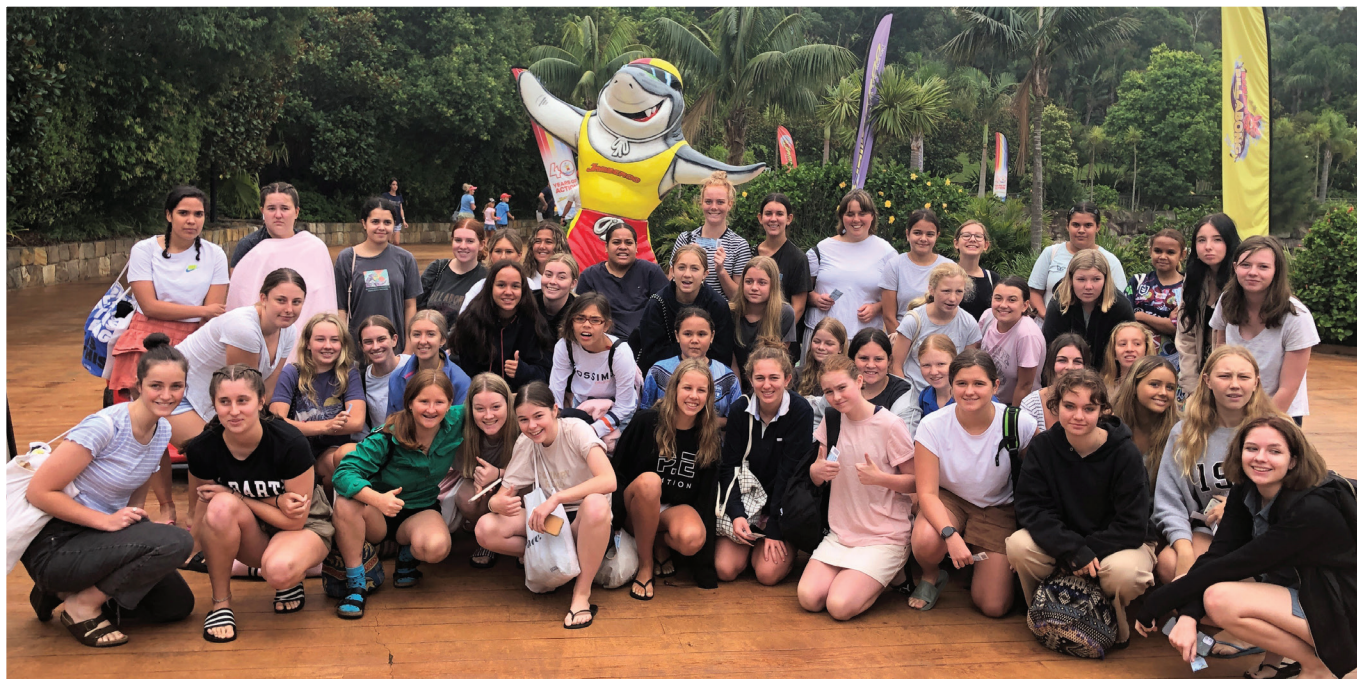
Boarders enjoying an 'In-Weekend' at Jamberoo Action Park