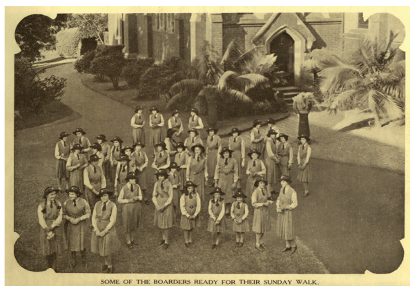
St Vincent's College is Australia's oldest registered Catholic girls' school

St Vincent's boarding provides an ideal mix of academic rigour, social interaction and a Boarding House comfort that feels like home. We are a friendly and accepting community ready to welcome Boarders from Years 7 to 12 who are keen to make friends, get involved and become part of our extraordinary boarding history.