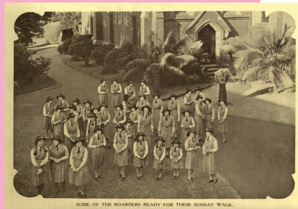
St Vincent's College is Australia's oldest registered Catholic girls' school

The College provides an ideal mix of academic rigour, social interaction and a Boarding House that feels like home. We are a friendly and accepting community ready to welcome students from Years 7 to 12 interested in becoming part of our extraordinary history.