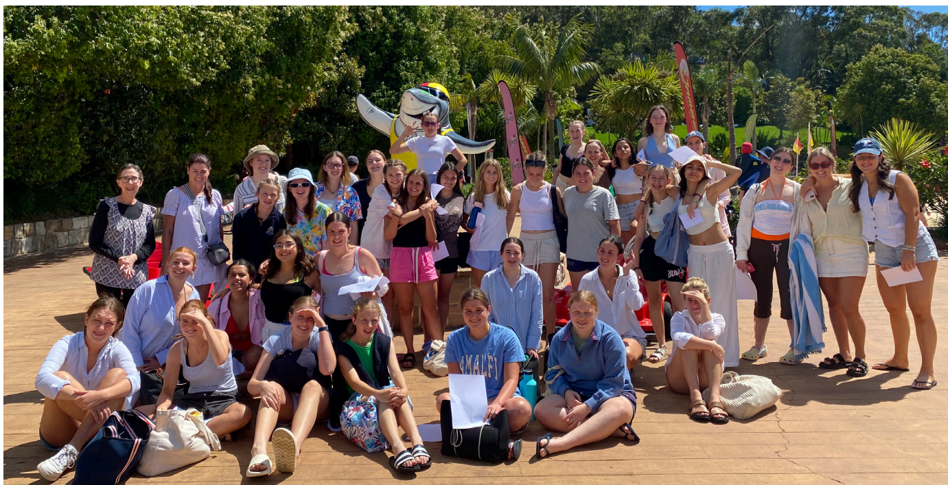
Boarders enjoying an 'In-Weekend' at Jamberoo Action Park